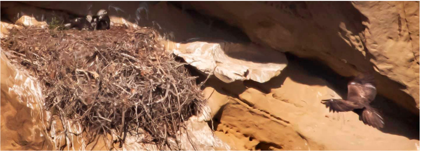
Golden eagle nest at Santa Susana with mom, dad and two eaglets.

Golden eagles have been spotted flying in and around the Santa Susana Field Laboratory for decades. The expansive areas of rocky bluffs and large former test stands provide the perfect nesting habitat for golden eagles and other raptors. In 2011, Boeing's biologists documented an active golden eagle nest at the site for the first time. Over the next decade, biologists monitored that eagle nest and observed no inhabitants. This summer, biologists